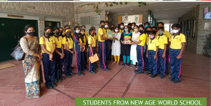
STUDENTS FROM NEW AGE WORLD SCHOOL