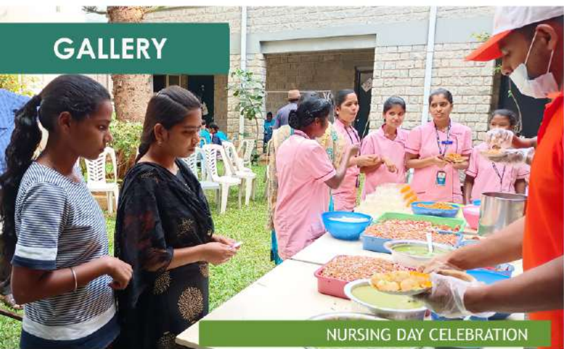
NURSING DAY CELEBRATION