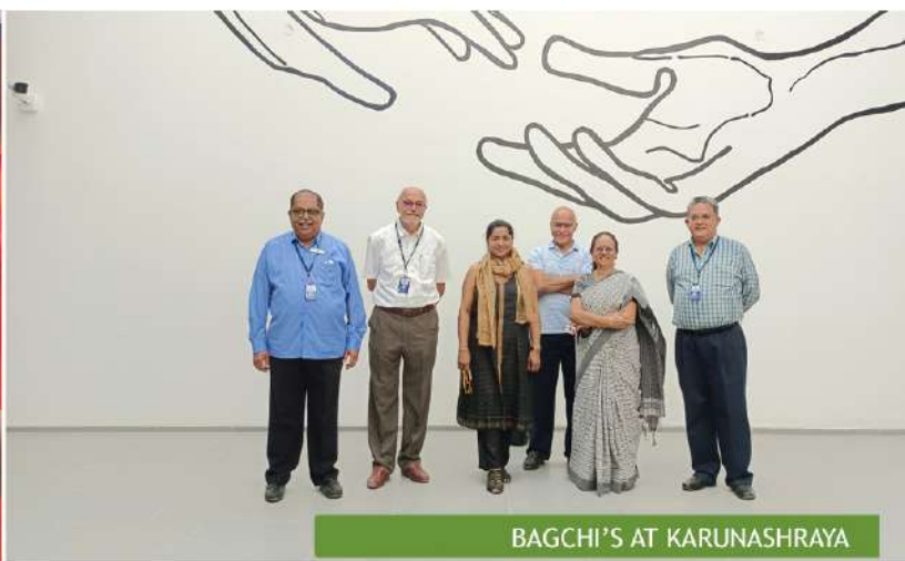
BAGCHI'S AT KARUNASHRAYA