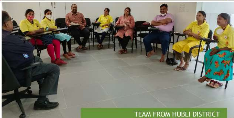
TEAM FROM HUBLI DISTRICT